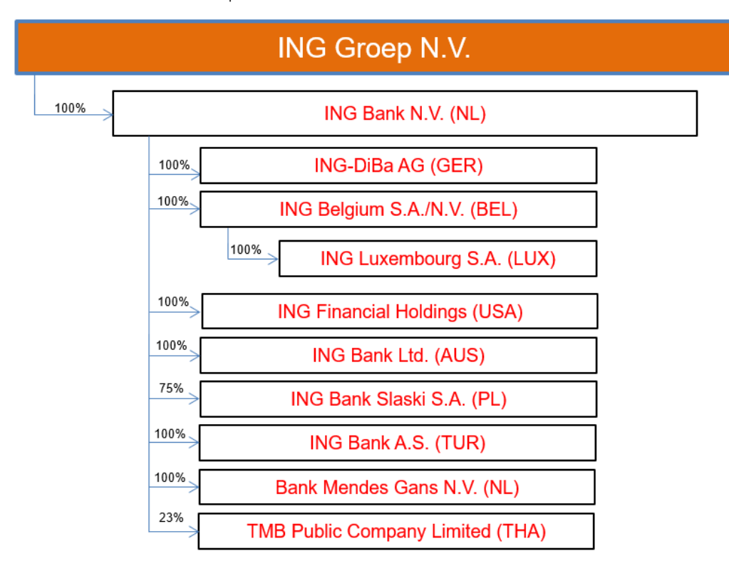
Chart 1: Principal subsidiaries, investments in associates and joint ventures of the ING Groep N.V.

Considering ING's development in the structure of the Group in recent years, there was only one major change. In July 2019, ING completed the sale of ING Lease Italy with the settlement price of about €1.1 billion.